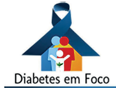
Figure 1. Diabetes em Foco application logo.

At first, in the planning for the execution of the application, its logo was created without cost (Figure 1), to expose graphically, its main goal.